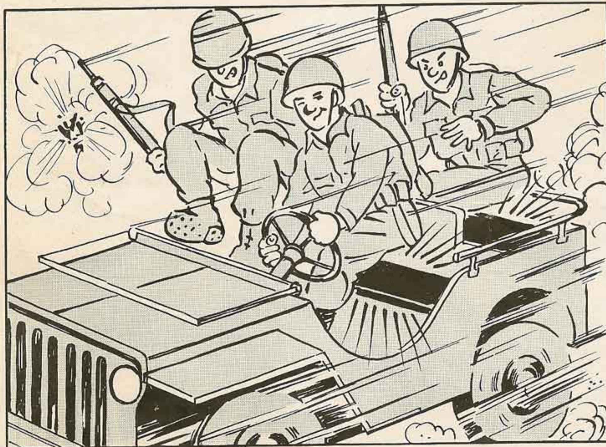
"Never Mind! They'll come down on Ypsi-Reed Cushions"

Have you wondered what will happen when war contracts stop and peace production resumes? Are you concerned with what plans Ypsilanti Reed has to meet this sudden impact? Well, the details cannot be revealed at this time, but it can be authoritatively disclosed that Ypsi-Reed's post-war production plans are already far beyond the blueprint stage. New products, new designs, new materials await the signal—a guarantee of full post-war employment not only for Ypsi-Reed's present employees but for the returning veterans of this community. The Ypsilanti Reed display at Chicago's 1944 Furniture Market gave a hint of what's in store for the future—a future bright with promise and hope.