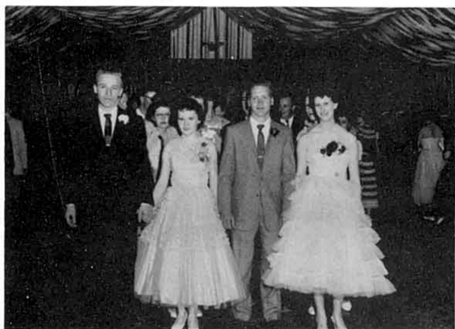
LEADERS OF GRAND MARCH